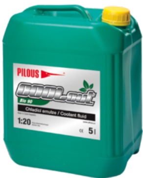
COOLcut Bio 90

In addition to use in saw bands the product is designed for machining operations carried out both on conventional machines and NC and CNC machining centres.