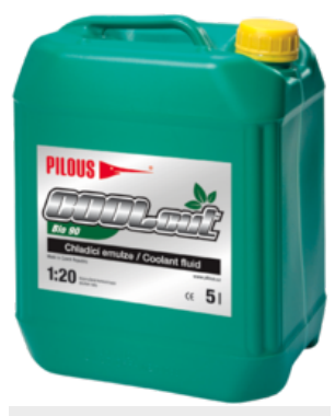
COOLcut Bio 90